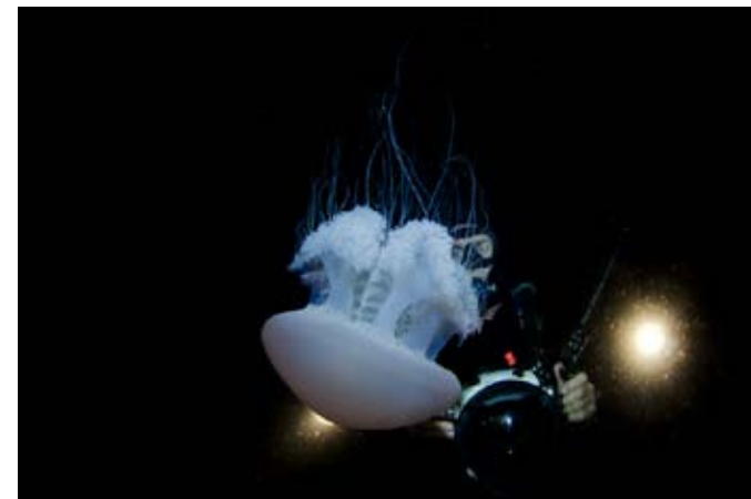
Sea Jellies come to the surface in numbers during a night dive. 1-40 sec at f 9.0. 10.0-17.0 mm f-3.5-4.5@10 mm. ISO 1000. NIKON D7000. Spot-Meter Mode