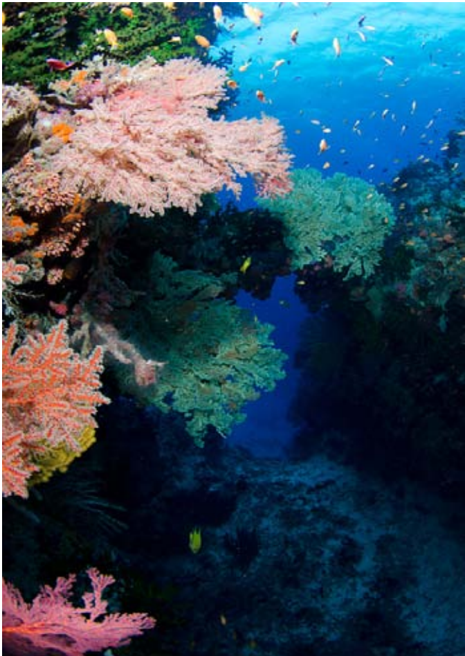
Fans on the Dog House at Diving Dog Passage. 1-60 sec at f9.0. 10.0-17.0 mm f-3.5-4.5@10 mm. ISO 400. NIKON D7000. Spot-Meter Mode

meters of water, sulphur dioxide and carbon dioxide gases rising from the magma below bubbles up through the reef. Although mostly sea grass and mud where the larger geysers are, there are some areas of normal coral reef with gas bubbling up around the corals. It is possible to swim straight over the top of the bubbles and feel the difference in water temperature. It is quite astonishing to see a profusion of life in what one would think would be such inhospitable conditions.