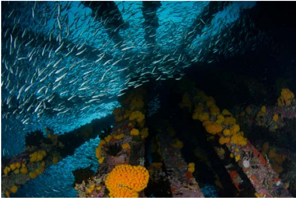
Samarai Wharf, not named after anything Japanese even though it sounds like it. 1-100 sec at f8.0. 10.0-17.0 mm f-3.5-4.5@10 mm. ISO 400. NIKON D7000 Spot-Meter Mode

dome port for close focus wide angle, and you can zoom into 17mm for shooting subjects further away.