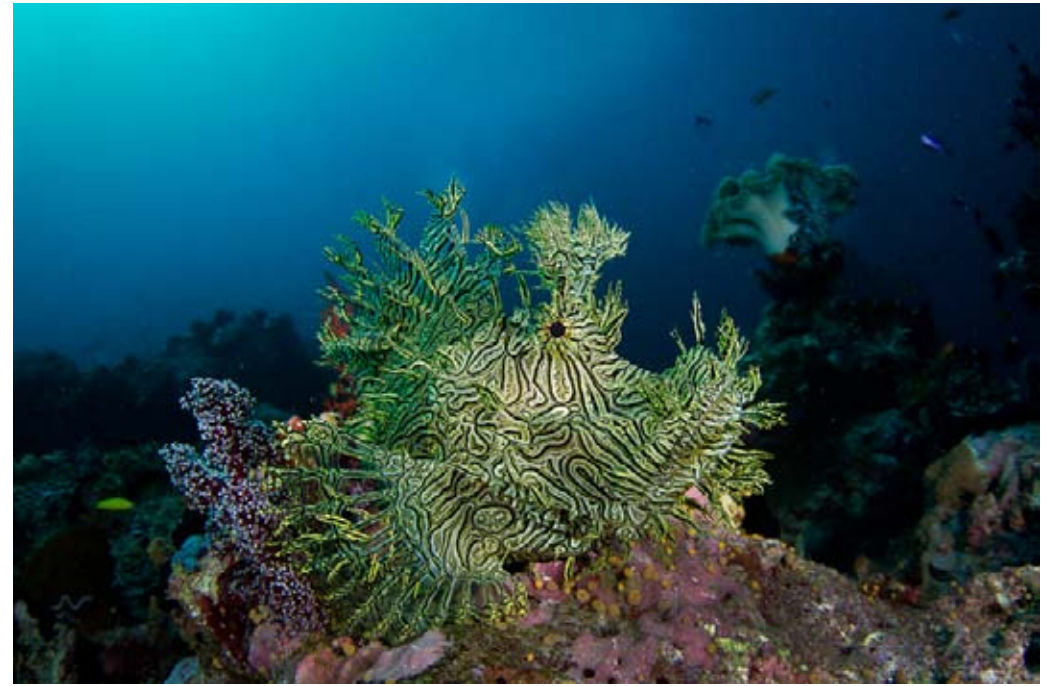
The 10-17 is perfect for larger subjects like this rhinopias aphanes. 1-250 sec at f-8.0. 10.0-17.0 mm f-3.5-4.5@13 mm. ISO 160**NIKON D7000. Spot-Meter Mode

worry about looking in the rubble for critters, as I couldn't take any photos of them anyway. I did relent on one dive and went in with a 60mm macro lens. After five minutes I saw a wobbegong swimming towards me beautifully framed by the jetty. I went straight back to the boat with the hump and changed back to wide angle. This is really the best way to get the shots that you want, as in between dives you have the chance to review your efforts over a cup of tea, and then work out what, if anything, was going wrong and go back in