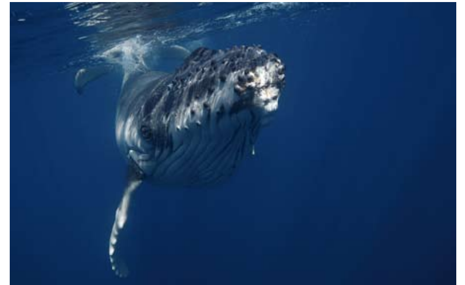
Curious calf swimming up for a closer look

Being as different as our two species are, it's actually not all that surprising that there are still many things we haven't worked out about humpbacks. Most people who study these whales probably don't actually have the opportunity to spend much time around them, much less in the water with them.