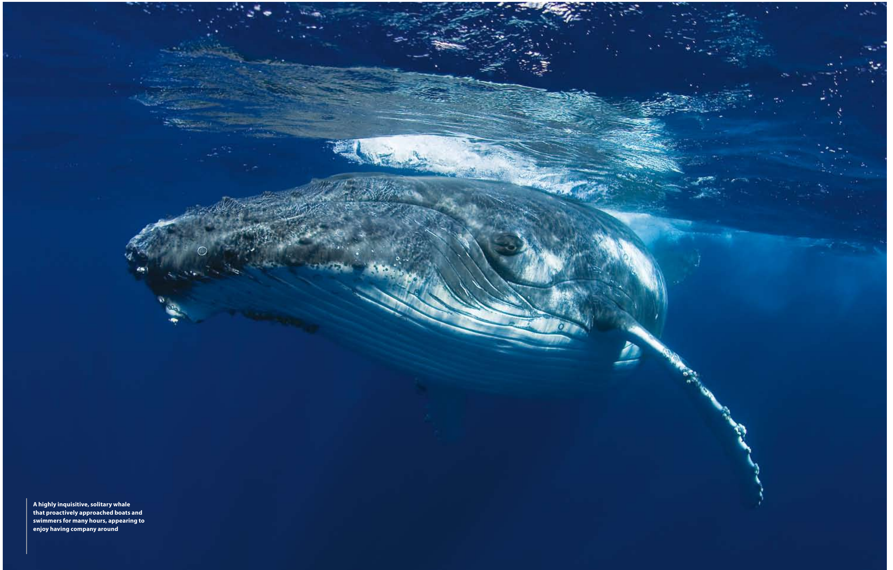
A highly inquisitive, solitary whale that proactively approached boats and swimmers for many hours, appearing to enjoy having company around