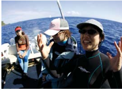
"Honestly, the whale was holding its hands out just like this!" (See photo to right)