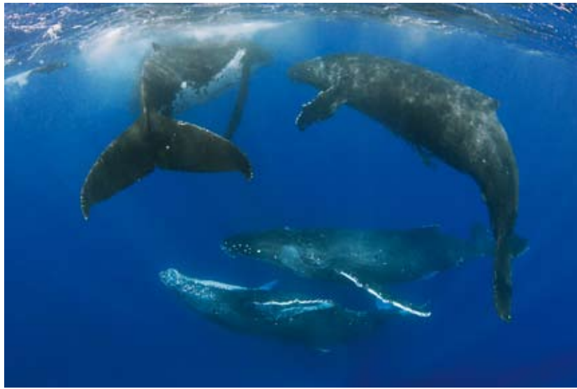
Four whales hanging out in between periods of activity. Note the teeny-tiny person in the upper left-hand corner of the photograph, who provides a sense of scale.