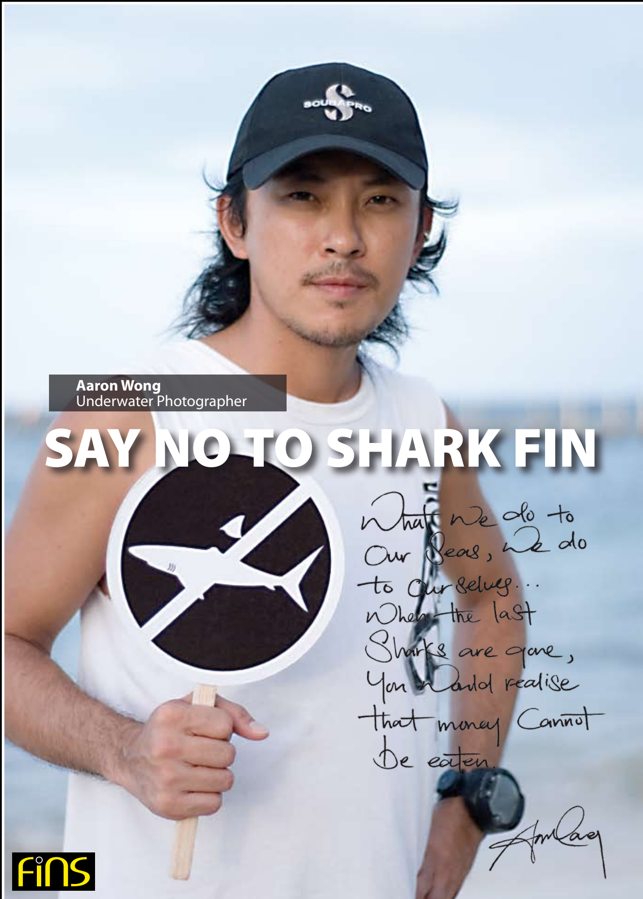
Aaron Wong Underwater Photographer